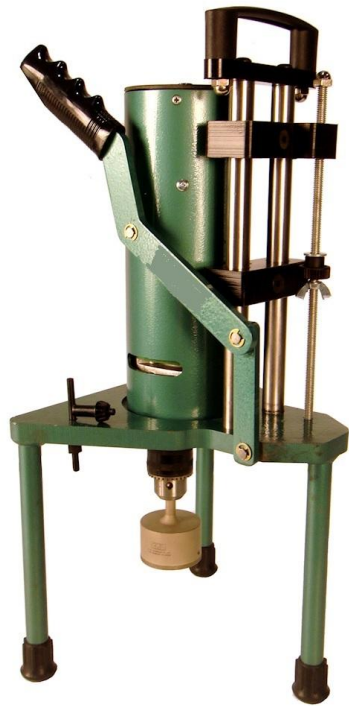
Rear View of Drill showing Vertical Way Guides & Drill Depth Stop Mechanism