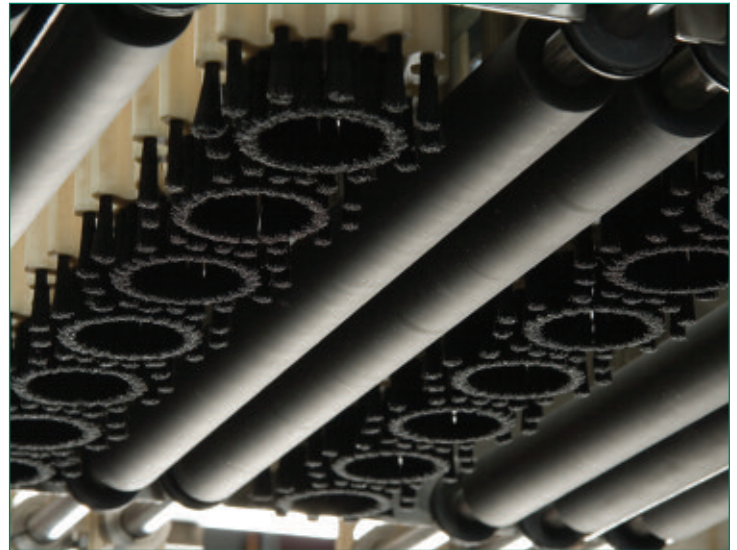
Top Surface Oscillating Scrubber Section: Internal View